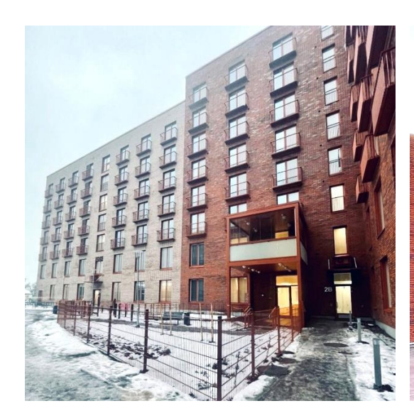
Turku Herttuankulma – Turku (FI)

During the fourth quarter of 2022, eighteen development projects, one renovation project and one extension project from Aedifica's investment programme were completed in the Netherlands, Germany, the United Kingdom and Finland for a total amount of approx. €197 million, adding capacity for 1,094 residents and 345 children to Aedifica's portfolio. These care properties are operated by a diversified pool of well-established and experienced private (both for-profit and non-profit) and public operators (specifically Finnish municipalities). The nine projects in Finland have been designed and developed by our local Hoivatilat team.