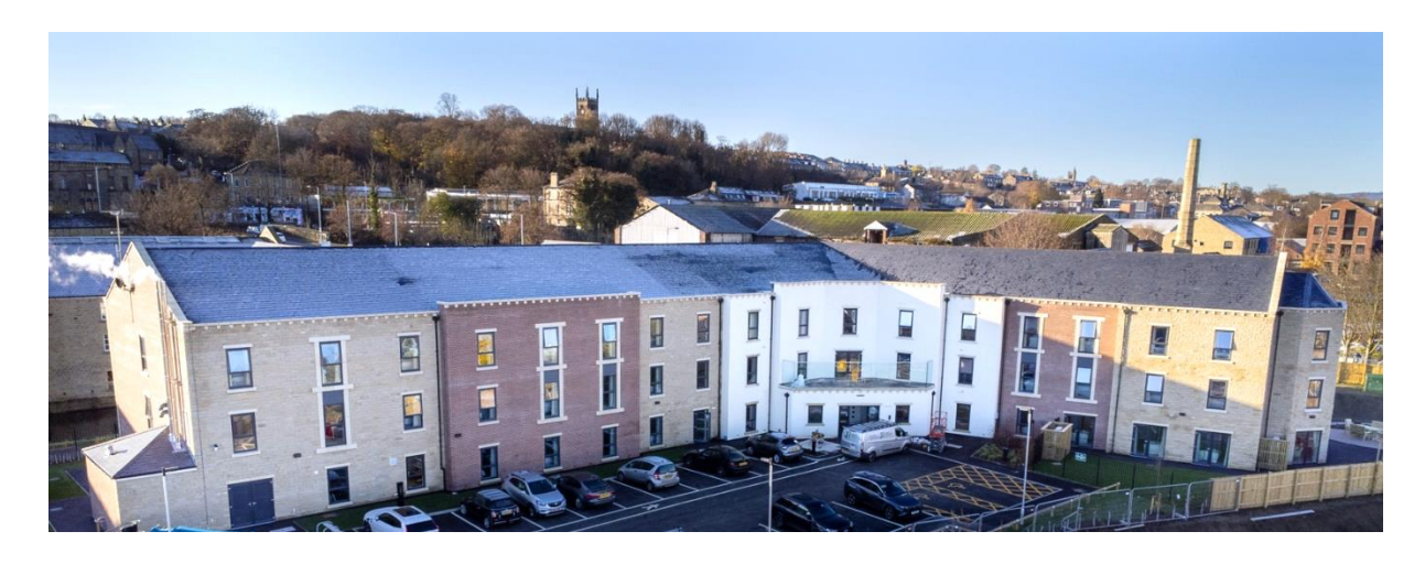
Shipley Canal Works - Shipley (UK)

10 January 2023 – after closing of markets Under embargo until 17:40 CET