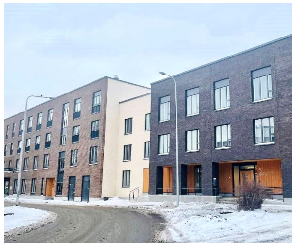
Helsinki Malminkartano - Helsinki (FI)