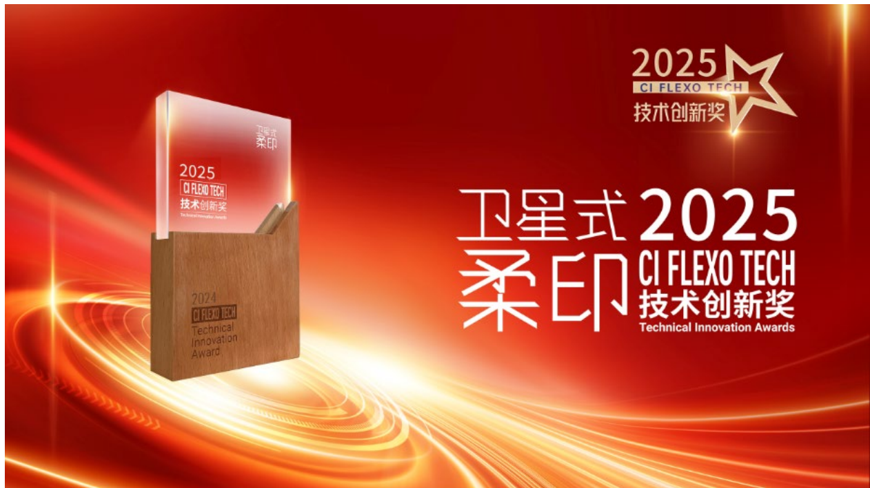
Image: 2025 CI Flexo Tech Award